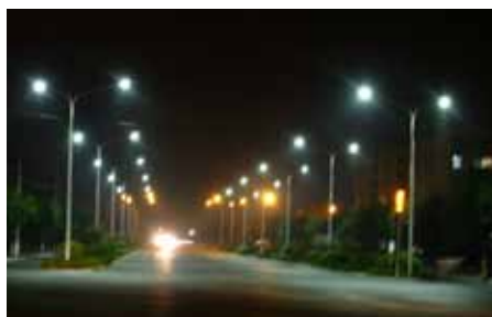
DESIGN & CONSTRUCTION