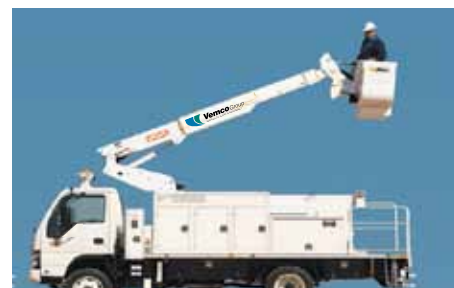
SPECIALITY FLEET SOLUTIONS