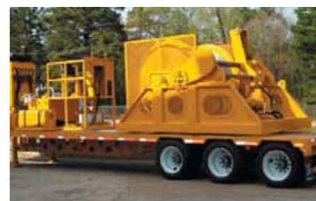
TOOLS & EQUIPMENT