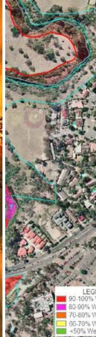
CONSULTANCY & PROJECT MANAGEMENT