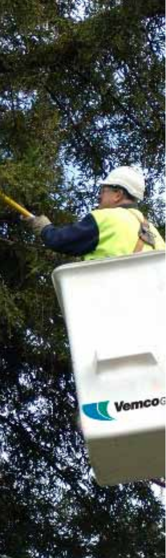
VEGETATION MANAGEMENT FOR UTILITIES