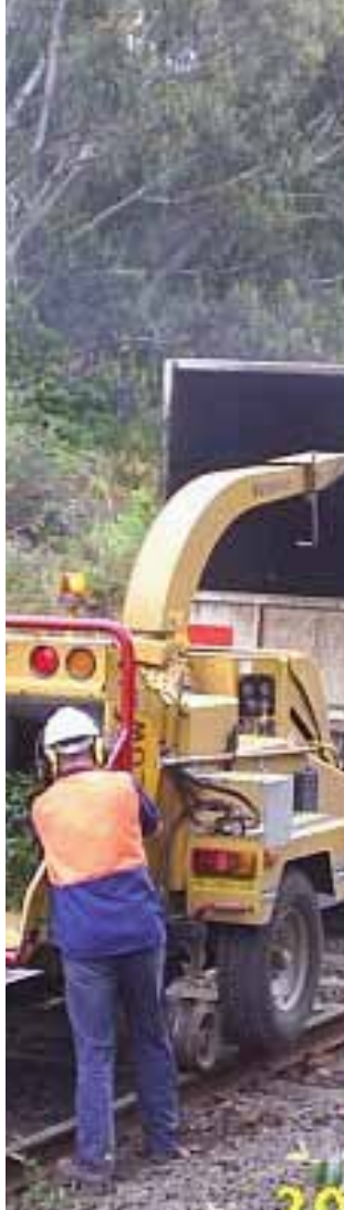
INFRASTRUCTURE & PIPELINES